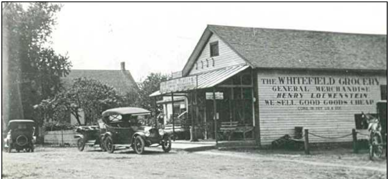
Whitfield Grocery Store. Does anyone have any information regarding this? Time period, etc?